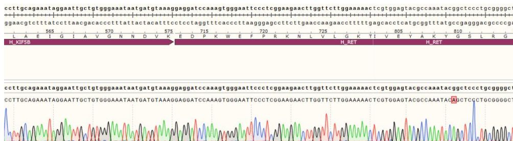
Figure 2 | The KIF5B-RET mutation analysis by Sanger sequencing.